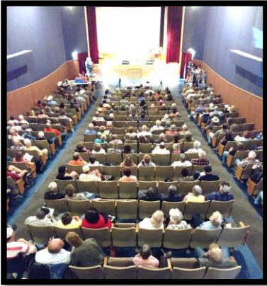
Audience at the LanTex Theater, Apr 2, 2016